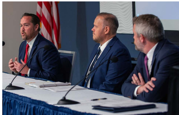
The Latin America Regional Committee spring 2022 meeting.