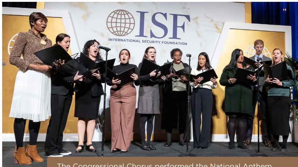
The Congressional Chorus performed the National Anthem.