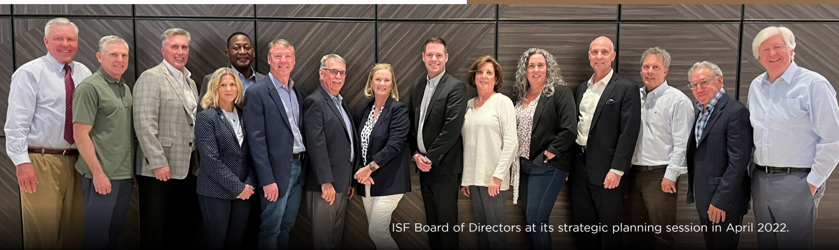
ISF Board of Directors at its strategic planning session in April 2022.

This past year saw exciting new initiatives for the ISF. In April, the ISF Board of Directors met in Washington, D.C. to create a strategic plan for the ISF. The four pillars of the adopted strategic plan are: