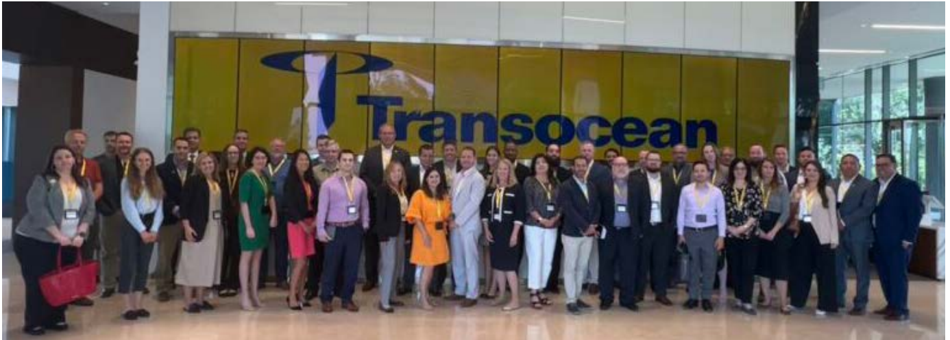
Energy Sector Committee spring meeting.

Donor support in 2022 included sponsorship of numerous Common Interest Committee events and Country Chapters to a reception following OSAC's ringing of the Nasdaq bell and the launch event for the newest OSAC Affinity Group, the Global Security Pride Committee, which underscores the need for representation of the LGBTQIA+ community within global security.