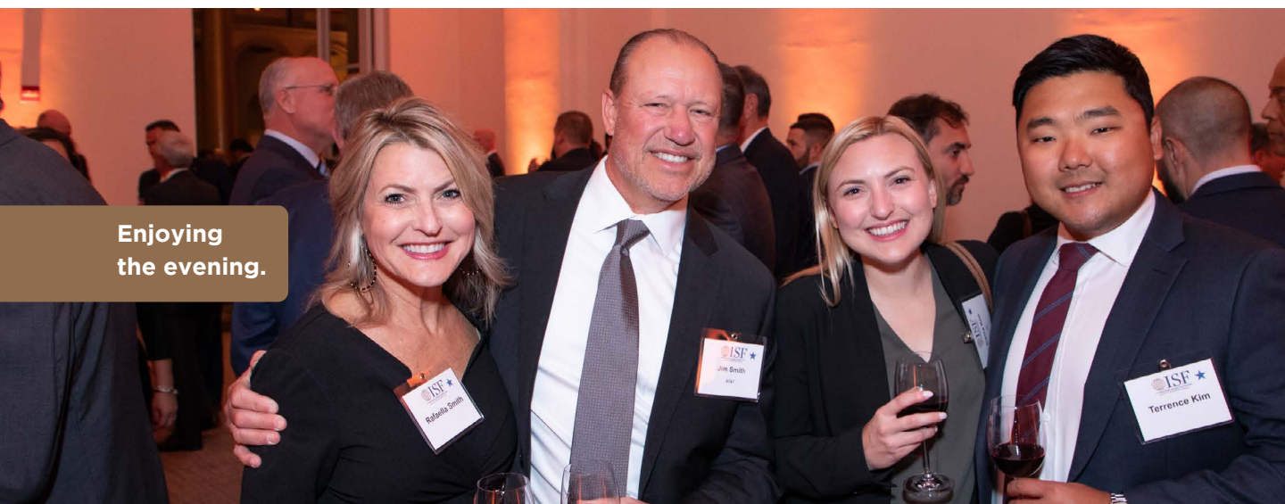
Enjoying the evening.