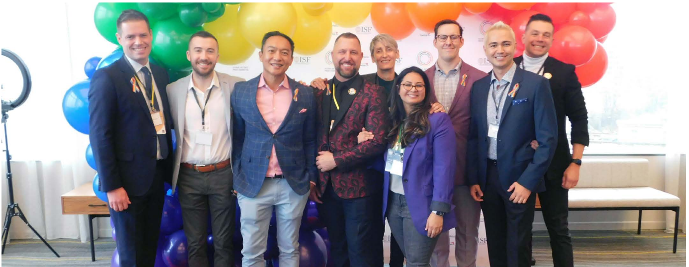
Global Security Pride Committee at its launch event during OSAC Annual Briefing Week.