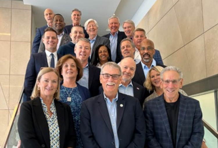
The ISF Board of Directors at its April 2023 Strategic Planning session

Following the February 2023 merger with Domestic Security Partnership, the ISF sponsored its first Domestic Security Alliance Council (DSAC) meeting and ISF Reception in May 2023. Pictured are the 2023 DSAC Distinguished Achievement Awards winners.