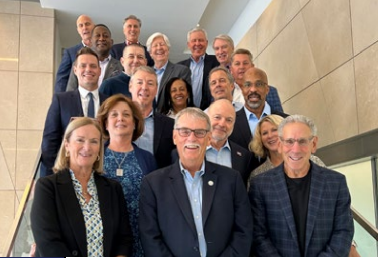
The ISF Board of Directors at its April 2023 Strategic Planning session

Following the February 2023 merger with Domestic Security Partnership, the ISF sponsored its first Domestic Security Alliance Council (DSAC) meeting and ISF Reception in May 2023. Pictured are the 2023 DSAC Distinguished Achievement Awards winners.