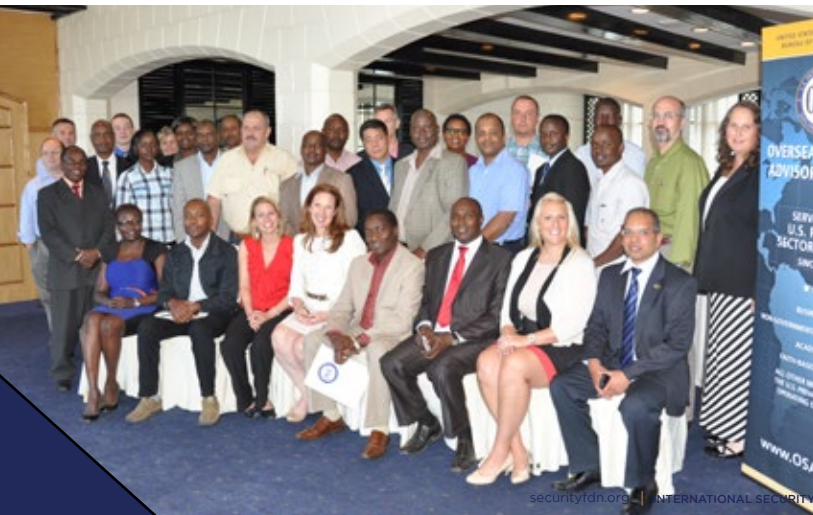
The first ISF-funded OSAC event: The Nairobi Country Chapter meeting in October 2013, following the terrorist attack on the Westgate Mall.