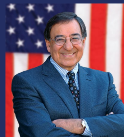
Leon E. Panetta

Former Secretary of Defense Former Director of the Central Intelligence Agency